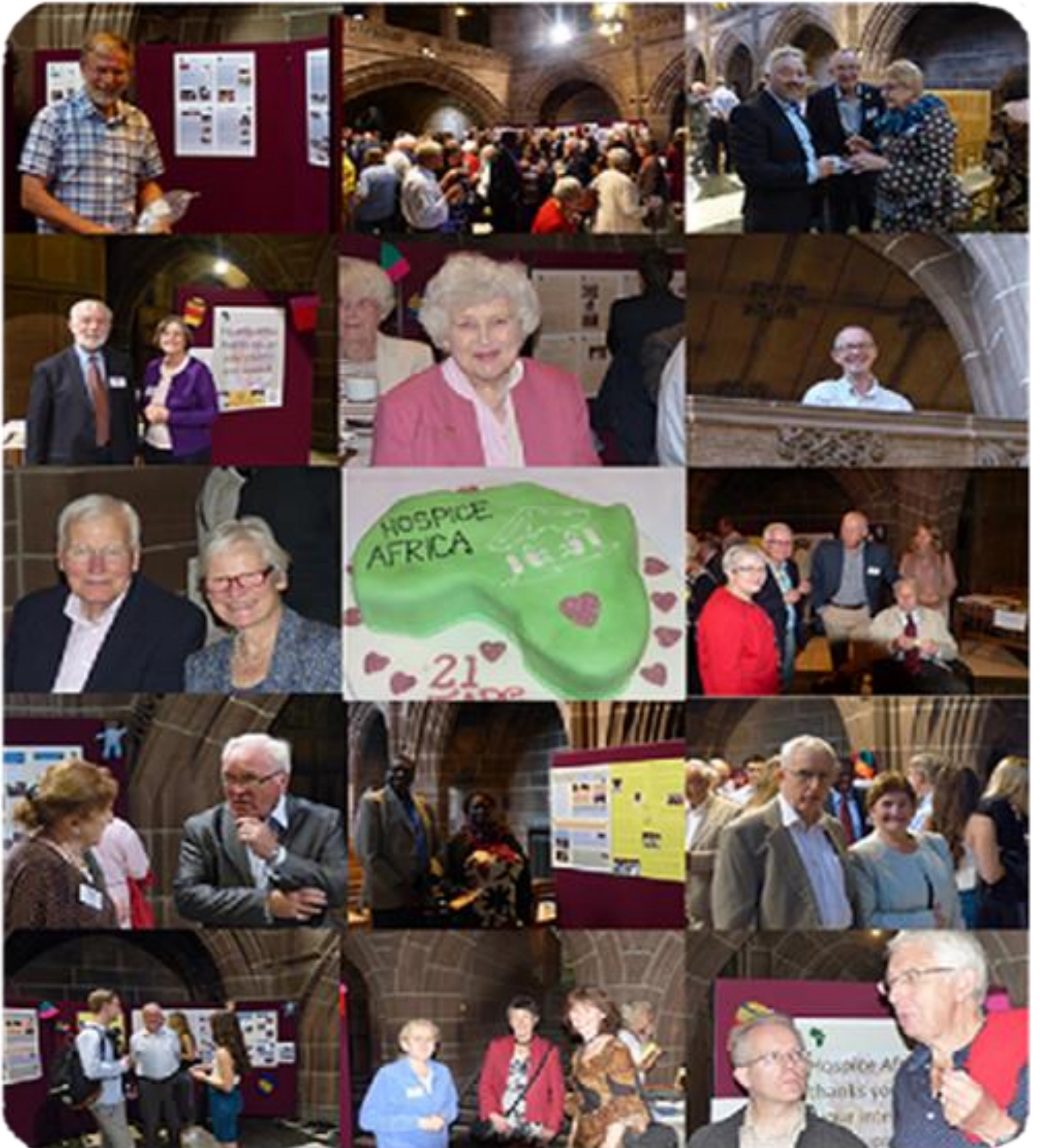
21 st Birthday Celebration Collage